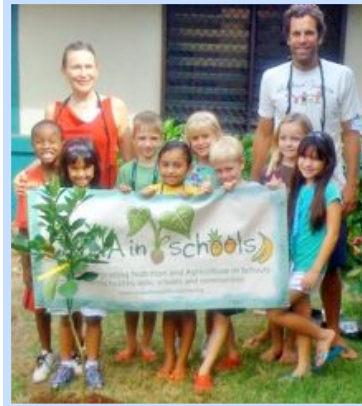
Performer Jack Johnson and myself with 'Aikahi students on Planting Day

Our Navy partner, VP-4 , has become increasingly involved in numerous programs and projects on campus, including their volunteer efforts helping A+ Program students with homework and the many long hours they've put in supporting several ongoing beautification projects, like the improvement of the vast drainage ditch area. Most importantly to our keiki, however, is that VP-4 has volunteered to serve as the military muscle behind our Turkey Trot this year! In fact, our 20th Annual Turkey Trot will be this Wednesday, November 23rd beginning at 8am! We hope you will