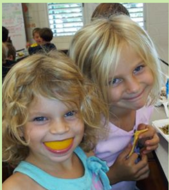
Aikahi's keiiki enjoy their healthy choices!

This month ' ĀINA IS Nutrition Docents taught 2nd and 6th Graders about whole grains and energy foods as well as the many reasons to read food labels. Students enjoyed a delicious and healthy wholegrain cracker with locally sourced Poha Berry jam snack as well.