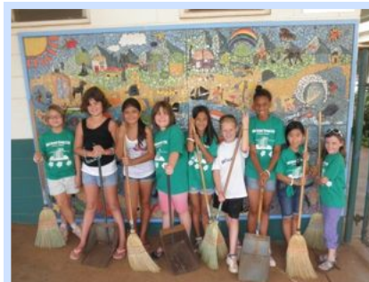
'Aikahi's 3rd Grade Girl Scouts